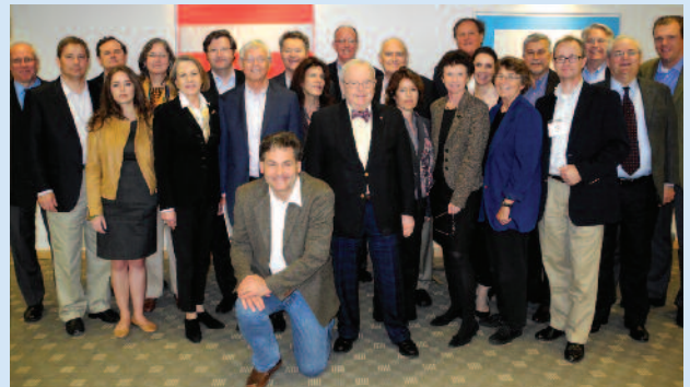
Warburg Chapter leaders gathered at the Chapter Directors Conference in San Diego