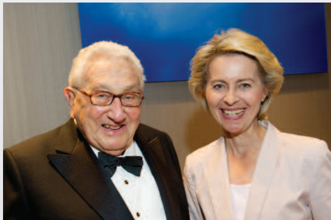
ACG Director Dr. Henry A. Kissinger and German Defense Minister Ursula von der Leyen