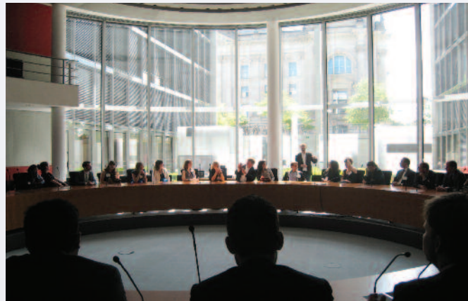
A session of the American-German Young Leaders Conference

The American Council on Germany (ACG) is an independent, nonpartisan nonprofit organization that promotes dialogue among leaders from business, government, and the media in the United States and Europe. The ACG strengthens transatlantic understanding and coordinates policy initiatives on key issues in the post-September 11th world.