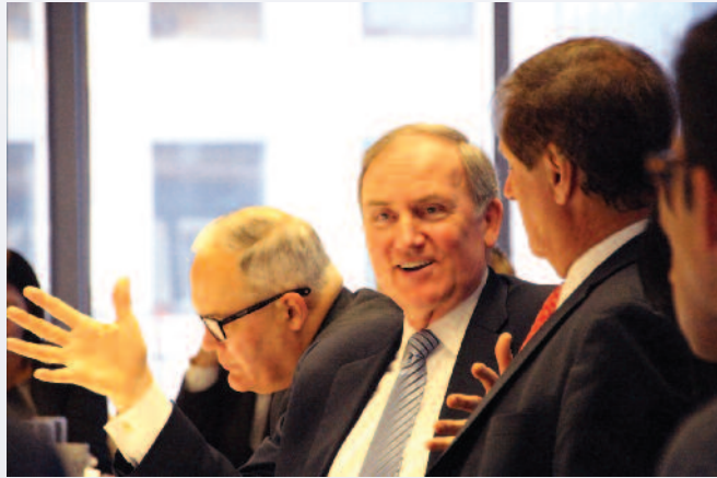
ACG Chairman Ambassador Robert M. Kimmitt recounting his personal experiences around the fall of the Wall