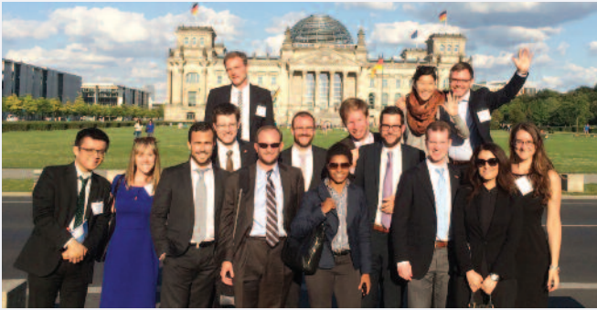
A group of 2014 Young Leaders by the German Bundestag

The American-German Young Leaders Conferences are designed to engage up-and-coming American and German professionals in an intense exploration of issues on the transatlantic agenda while forming a strong network of influential thought leaders. Forty-seven Young Leaders gathered from August 10 to 15, 2014, in Berlin to look at the future of German-American relations and to confront the admittedly sobering overarching theme of the conference: “Unconscious Uncoupling: Are the U.S. and Europe Still in a Relationship?” The delegates hail from a wide range of fields, including banking, economics, government, media, the military, law, and entrepreneurship.