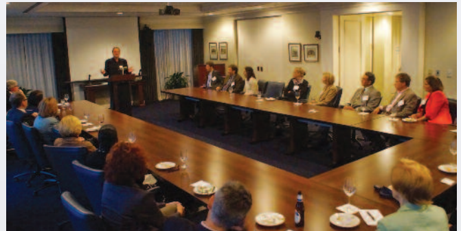
Speaker Peter Schneider, Author of Berlin Now: The City After the Wall , meeting with the Charlotte Warburg Chapter