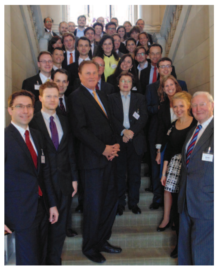
Participants and speakers at the Tripartite Young Leaders Conference in Washington, D.C.

The Tripartite Young Leaders Conference is designed to create an enduring network of future global leaders. The third and final segment of this conference series – on "The European Union in Crisis and the Transatlantic Partnership in Trouble" – brought together 30 young bankers, lawyers, academics, journalists, researchers, and leaders from the private and public sector from Germany, Poland, and the United States in Washington, D.C., from October 15 to 18, 2013. This program was held in cooperation with the Dräger Foundation and the Center for International Relations in Warsaw and was hosted by the German Marshall Fund of the United States.