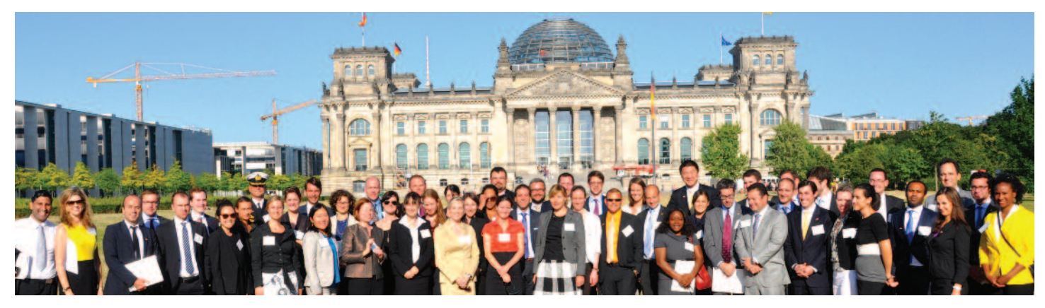
The 2013 American-German Young Leaders at the German Reichstag