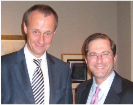
Friedrich Merz, Chairman of the Atlantik-Brücke e.V. and Partner at Mayer Brown LLP, and ACG Board Member Alex M. Azar II, Vice President of Business-to-Business at Eli Lilly and Company (left to right)

The American Council on Germany's corporate membership program is designed to give leaders in the German-American business community unique insights into economic and political developments through special policy discussions, publications, and more. Corporate members have the opportunity to meet directly with various German officials, journalists, academics, and other experts to discuss the issues of the day, and to network with others who are actively engaged in the transatlantic relationship. Top contributors are automatically members of the Business Advisory Committee (BAC).